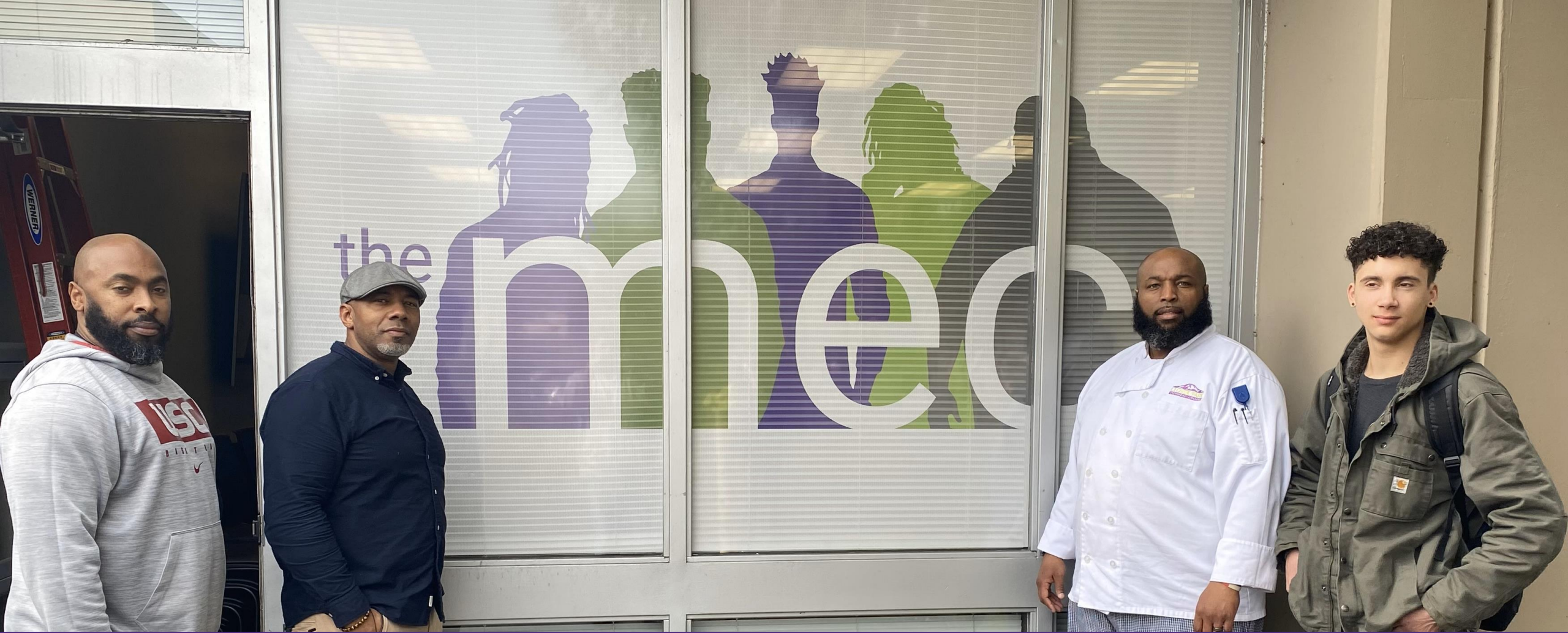
MEC Logo Visible From the Outside Entrance