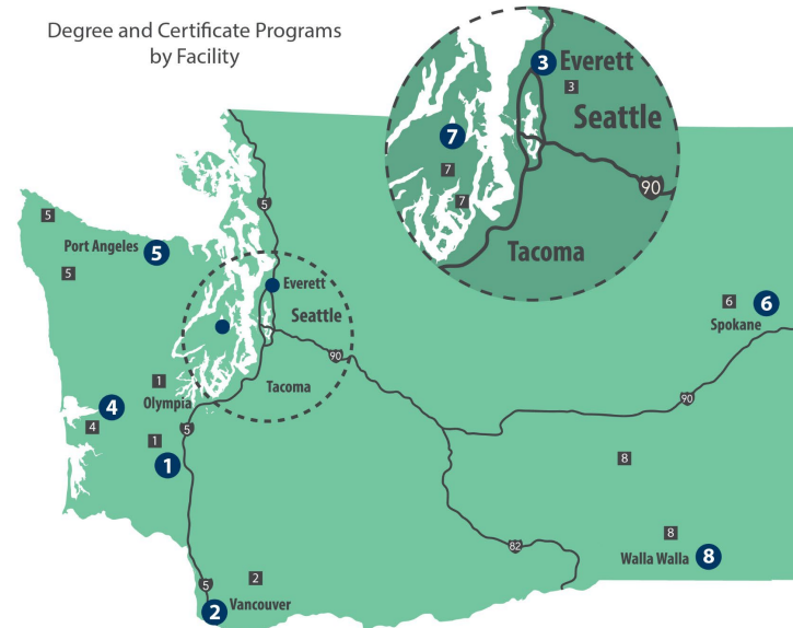
Degree and Certificate Programs by Facility