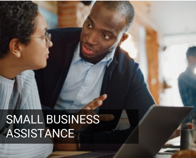
SMALL BUSINESS ASSISTANCE