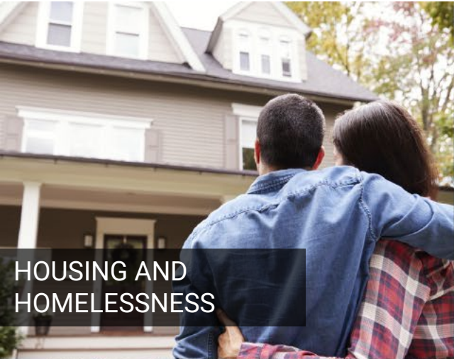
HOUSING AND HOMELESSNESS