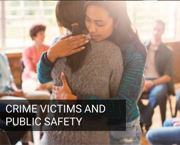
CRIME VICTIMS AND PUBLIC SAFETY