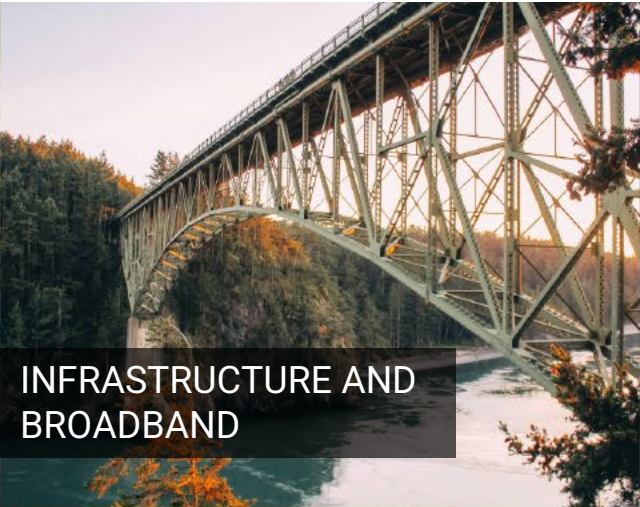
INFRASTRUCTURE AND BROADBAND