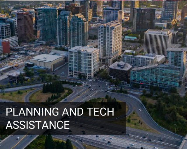
PLANNING AND TECH ASSISTANCE